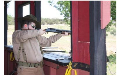
Competitor Rattlesnake Wrangler takes aim at Ormsby Ranch. Shooters young, old and in between participate in shooting competition held by the Lone Star Frontier Shooting Club, held the second weekend of each month at Ormsby Ranch